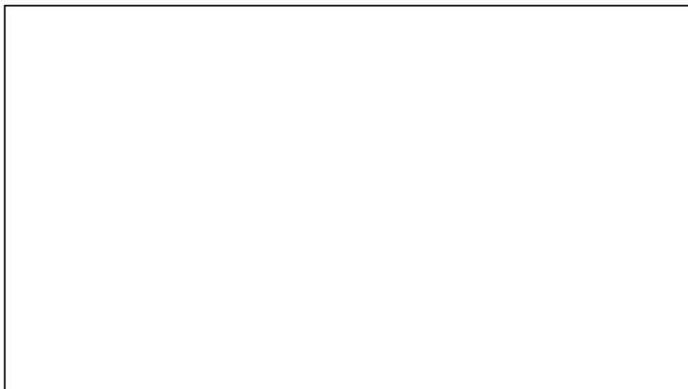
Front Panel - x1